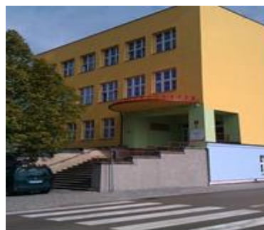
Secondary vocational school