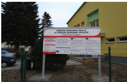
Hall of professional training and practice